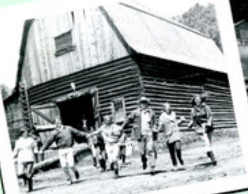
Excitement of the first day of the ranches.