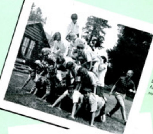
Back-breaking fun before supper.