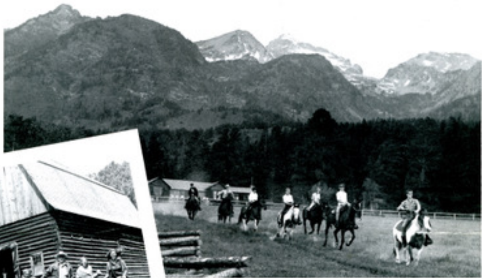
Campers lope across meadow in front of White Grass Lodge.