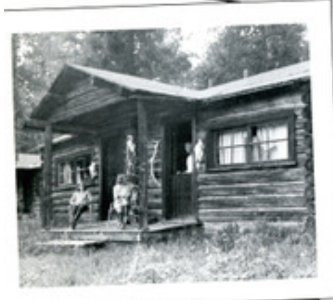
Time out at the cabin after a ride.