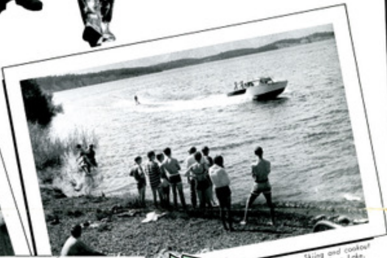
Skiing and cookout on Jackson Lake.