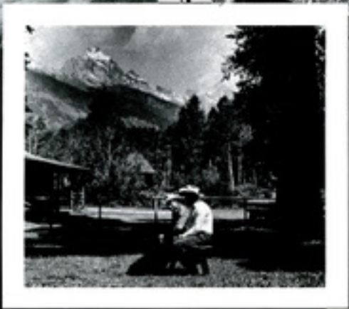
'R Lazy S' Ranch front yard.