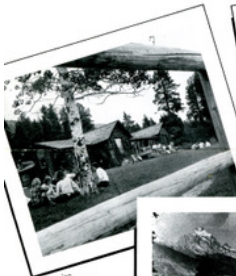
Discussion groups ponder some problems.

For teenagers who demand excitement, adventure, and something different, Westward-Ho offers a unique experience in Big Wyoming. Ten days packed with riding, hiking, swimming, boating and mountain climbing, lure vital young people to a once-in-a-lifetime opportunity.