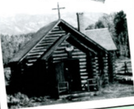
Chapel of the Transfiguration.